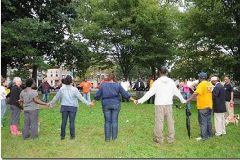
That's me with the grey pants and hoodie with my back to the camera!

There should be recognition that Crown Heights has old-timers that are capable of revitalizing their community while organizing along with the newcomers. The precedent for this was set by me and several others within Crown