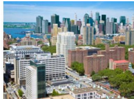
Avalon high-rises with the Fort Greene Housing Projects in the background, now converted into condominiums.

In the years prior to the coop-tation of these housing projects it was Brooklyn's largest low-income housing development. It was historically disinvested in until there was a realization that the capitalized ground rent was significantly lower than the potential ground rent as was iterated earlier by Neil Smith. In a nearby high-rise recently constructed, rents for studio apartments start at $2280 per month, a far cry from low-income housing prices.