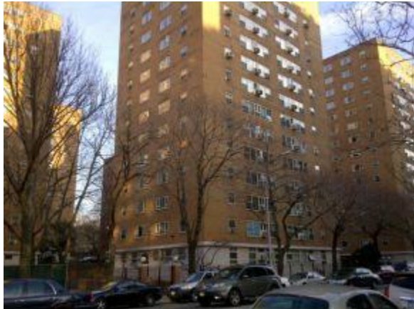
Ingersoll/Whitman Public Housing Development (Fort Green, Brooklyn), circa 1998