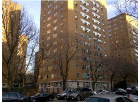
Fort Green Brooklyn co-op for sale, November 2011

So how would this renovation be implemented? According to City Limits the 1,526 families whose apartments were slated for overhaul were given three options: They could move to other apartments in their developments, move to other NYCHA complexes, or leave public housing entirely. The Housing Authority set up an onsite Relocation Assistance Unit and offered grants to cover moving expenses. Translation: Low-income out, middle-income to upper class in. According to nyc.gov, the Black population in Fort Greene declined by 32 percent from 2000-2010.