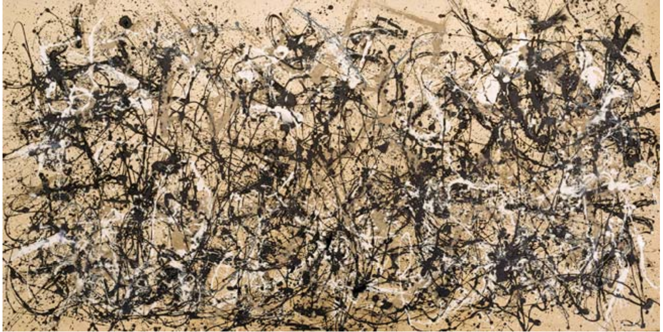
Jackson Pollack, Autumn Rhythm (No. 30), 1950

Similarly, the way viewers can see the bipolar tendencies in Pollack's paintings, readers can experience the extreme emotions caused by the disorder in Edgar Allan Poe's poetry. Although Poe's poetry was written a century earlier, his writing displays the same feelings as Pollack's paintings. In particular, we can see these types of emotions just by looking at a few versus in an excerpt taken from his poem "The Happiest Day".