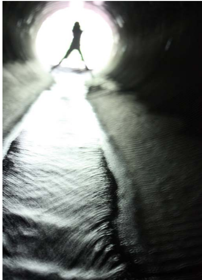
Insomnia affects the Mind by - insomnia81

operating heavy machinery. Once a person has been totally sleep deprived for long enough, they can experience “hypnagogic hallucinations” or, as defined by Wikipedia, “the transitional state between wakefulness and sleep...[where]..mental phenomena...occur...includ[ing] lucid dreaming, hallucinations, out of body experiences and sleep paralysis.” (Wikipedia July 2011) For anyone who has never experienced insomnia, the image above is an excellent display of how it feels. To lose even one night’s sleep is upsetting but losing multiple days can be damaging to a person’s mental well-being. “When you have insomnia, you’re never really asleep... and you’re never really awake.” (Imdb.com July 2011) Your brain becomes fuzzy your ability to focus becomes a challenge.